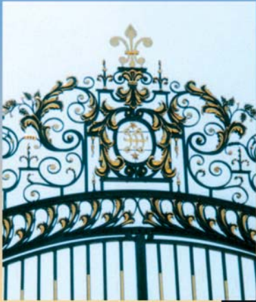
The Collins gate, outside of the Shrine

Finally, they arrived at a spot opposite the gate to Bahjí. There they bowed to the ground. It was one human way to honor their Lord. Slowly, they left the strange host to its adoration. Thoughtfully, they made their way to 'Akká. The guards were just closing the Land Gate to the city.