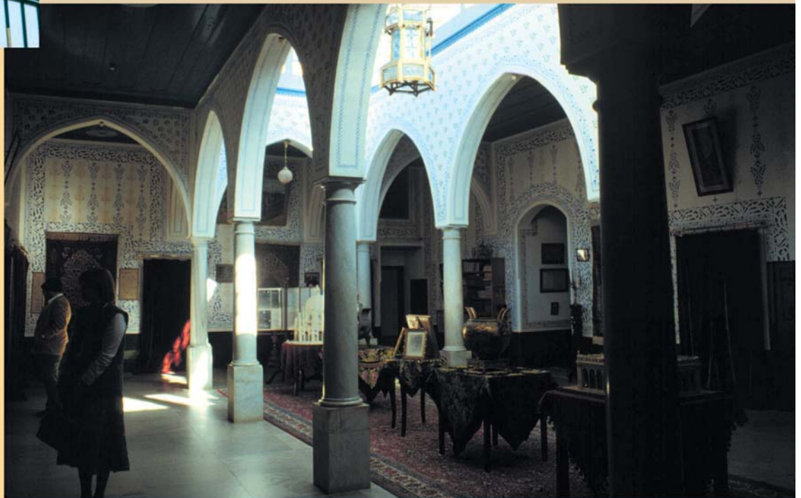
The inside of the top floor of the Mansion of Bahjí