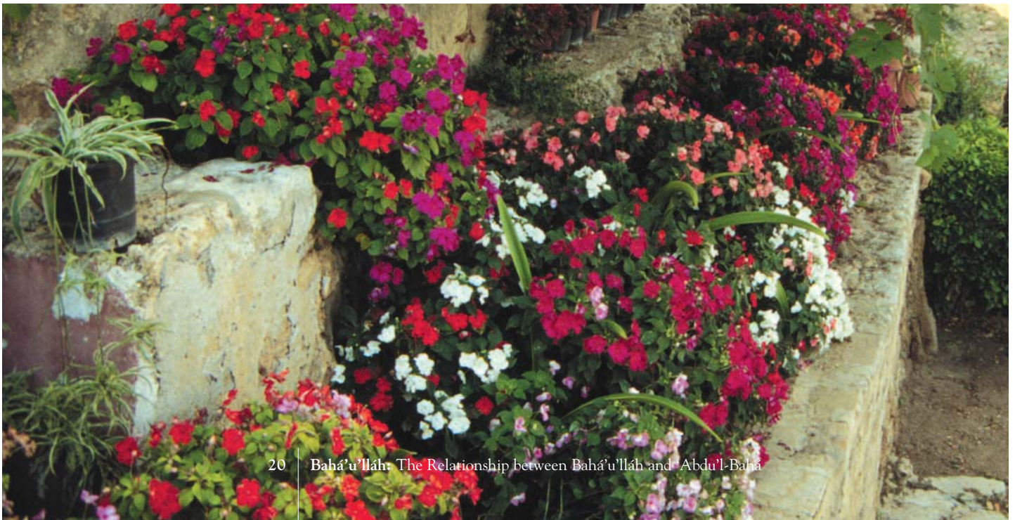
The Mansion of Mazra'ih

At Bahjí, Bahá'u'lláh met with the believers and revealed His Writings. 'Abdu'l-Bahá continued to live in 'Akká. There He met with the many officials and countless other people. He made sure that no one interfered with His Father's Revelation. No one was allowed to disrupt His peace and comfort. 'Abdu'l-Bahá was ever His Father's Shield. Bahá'u'lláh often said, "It is the Master who is able to endure all of these demands and still see to the comfort of the believers."