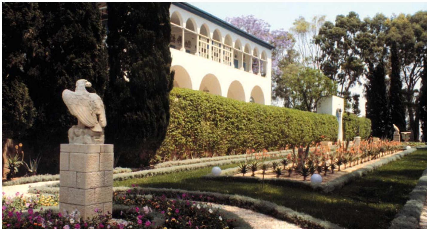
The Mansion of Bahjí

Bahá'u'lláh and 'Abdu'l-Bahá were often separated by the miles between 'Akká and Bahjí and Their many tasks. But nothing could interfere with the love between the Lord of the Age and His eldest Son. Mírzá Maḥmud had been with Bahá'u'lláh for many years. He knew about this love. He said, "Many a time I was in the presence of Bahá'u'lláh when the Master was also present. Because of His presence, Bahá'u'lláh would be filled with the utmost joy and gladness. One could see His blessed countenance beaming with delight . . . so lovingly that no words could describe it . . ."